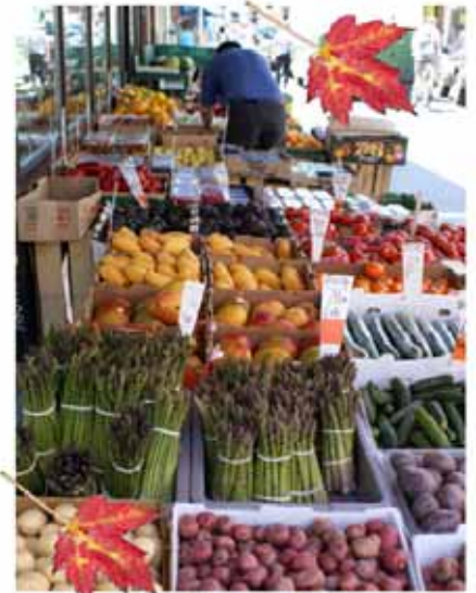
Junk In – Junk Out

Toronto is a city of villages, each with a unique atmosphere and often an ethnic colour that begs the tourist to explore. Kensington Market offers delights from fresh produce to vintage clothing and antiques. It borders on a vibrant Chinatown which in addition to other villages truly reflects the diversity of Canada in a substantial way similar to London.